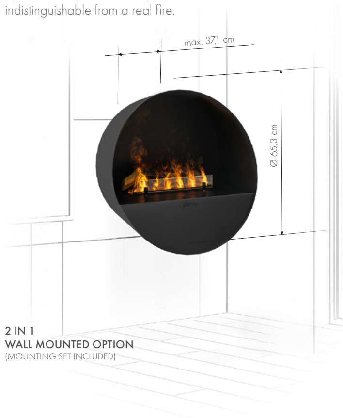
2 IN 1 WALL MOUNTED OPTION (MOUNTING SET INCLUDED)

This technology utilizes ultra-fine water mist and LED lighting to simulate the appearance of real flames. The water mist, produced by a silent ultrasonic atomizer, is illuminated by LED lights, creating a convincing illusion of flames that is almost indistinguishable from a real fire.