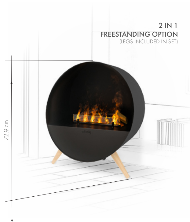
2 IN 1 FREESTANDING OPTION (LEGS INCLUDED IN SET)

Misty combines modern aesthetics with versatile functionality. Its distinctive spherical shape makes it a striking focal point in any room, while its dual wall and floor arrangement options offer flexibility in interior design.